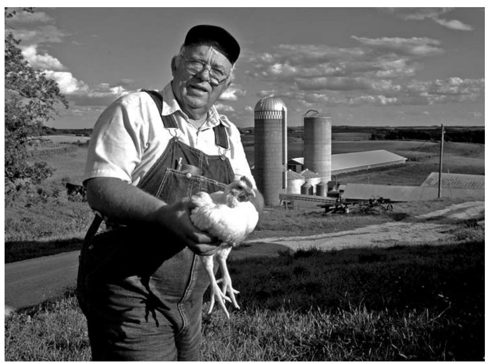
One powerful alternative design is Organic Valley, a cooperative with revenues of $330 million, which is owned by 1,183 organic family farms and allows farmers to stay small while selling nationally.

Case studies in corporate design for human well-being